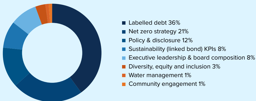
FIGURE 3: ENGAGEMENTS BY SUSTAINABILITY THEME

As of July 2024, the “Dear CFO” program has outwardly committed nearly $2 billion (CAD) towards inaugural sustainable fixed income issuance. Issuers within the program have seen over $10 billion (CAD) in downstream labelled debt issuance.